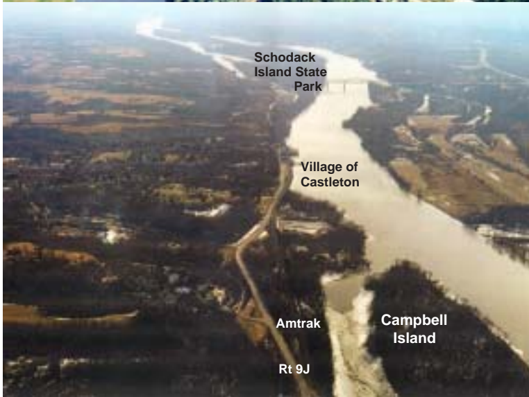
^ Winter View from Campbell south to Schodack State Island Park

Campbell is an island-peninsula whose western shore runs nearly 5,000 feet along the Hudson, next to 3,000 feet of NY state land; its eastern shore lies along the Papscaenee Creek. Wildlife and flowers abound.