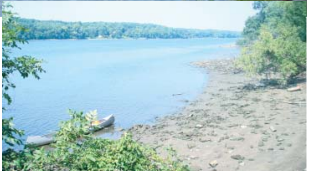
View of Bethlehem town park and boat launch from Campbell cove